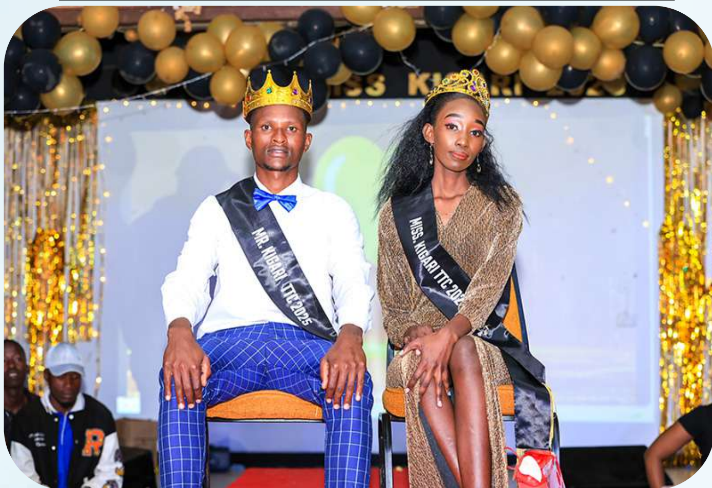
Mr and Miss Kigari 2025