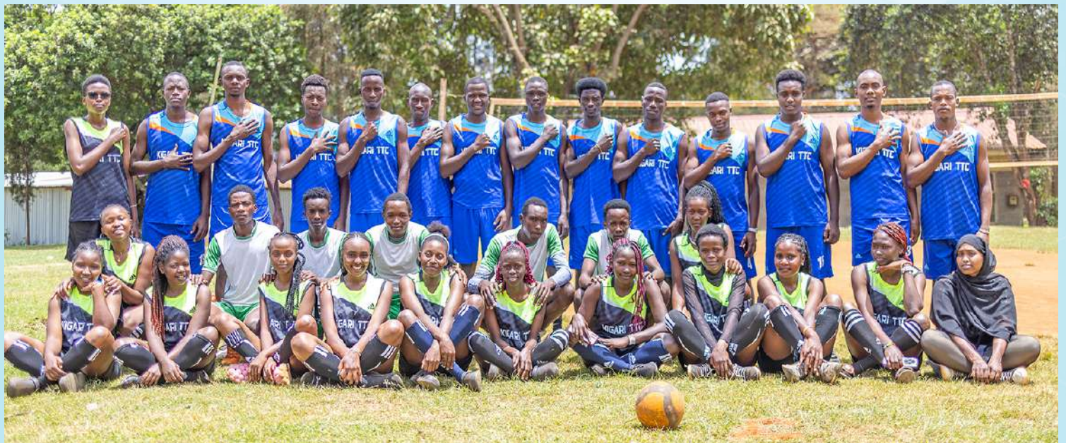
Volleyball Men and ladies team