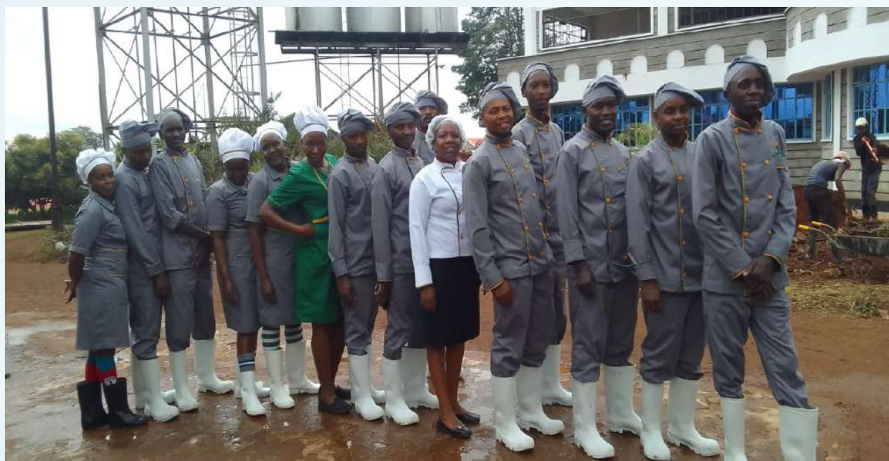
The kitchen staff