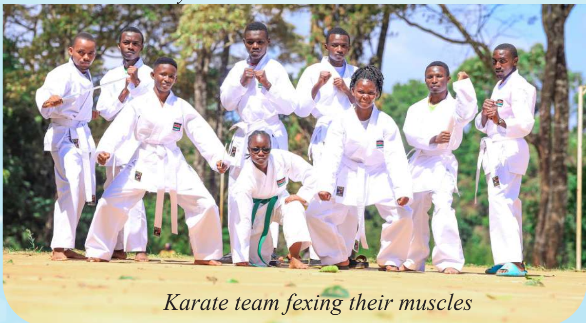
Karate team flexing their muscles