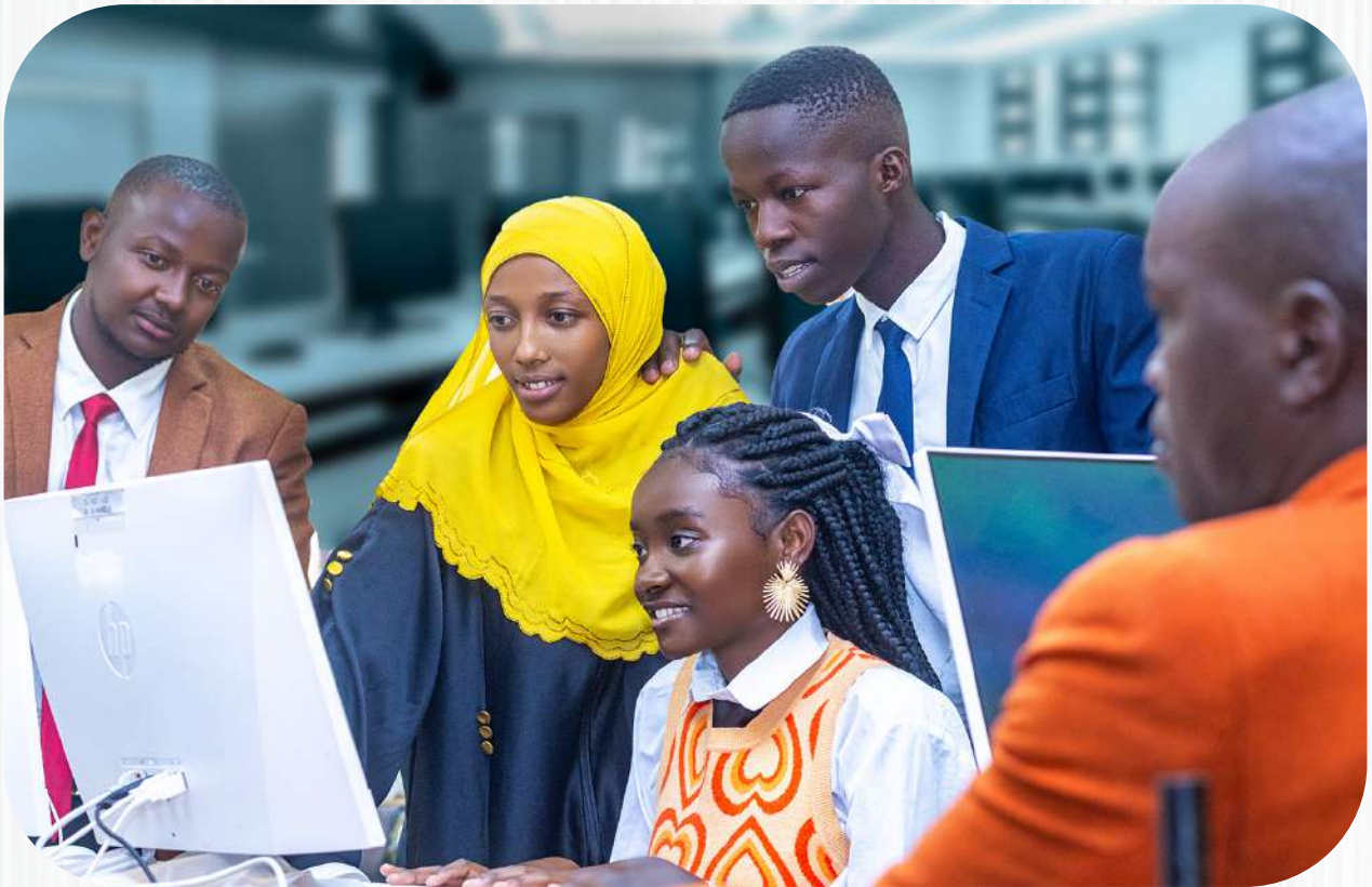
Teacher trainees sharing knowledge in the I-Hub laboratory