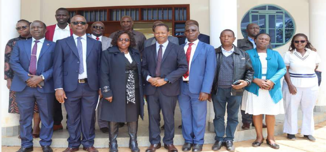
The BOM members