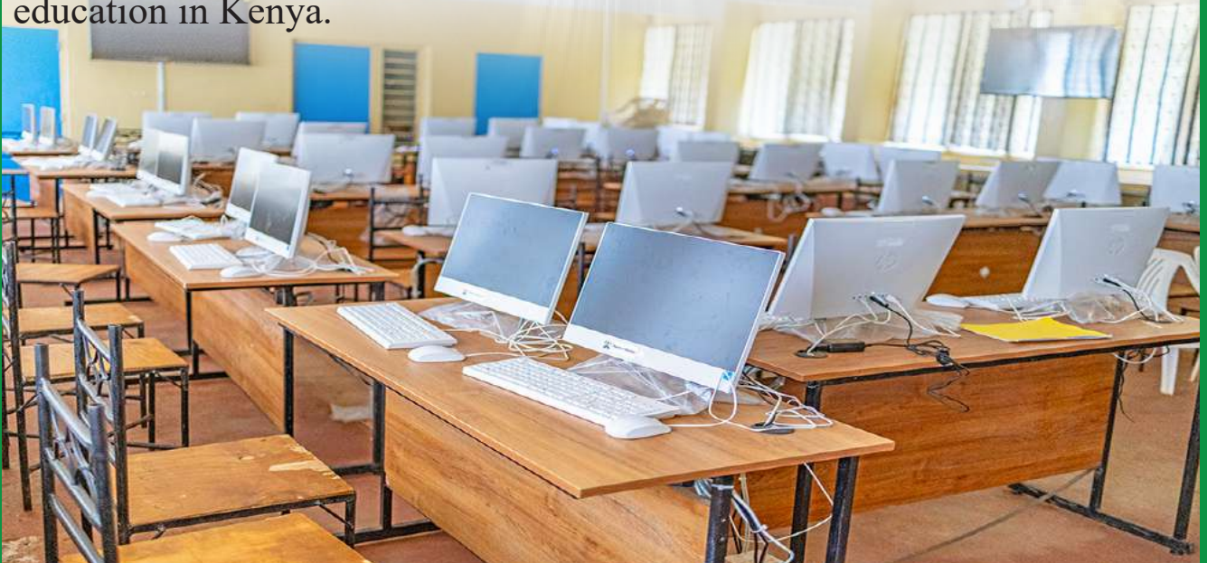
Modern I-Hub Laboratory equipped with latest Technology

I wish you all God's blessings as you take the next steps in your professional and personal lives. Your achievement today is a beacon of hope and progress for St. Mark's Teacher's College and the future of education in Kenya.